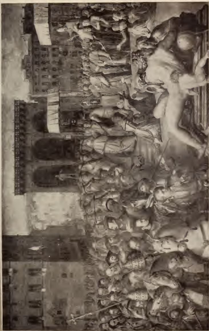
LEO X'S STATE ENTRY INTO FLORENCE